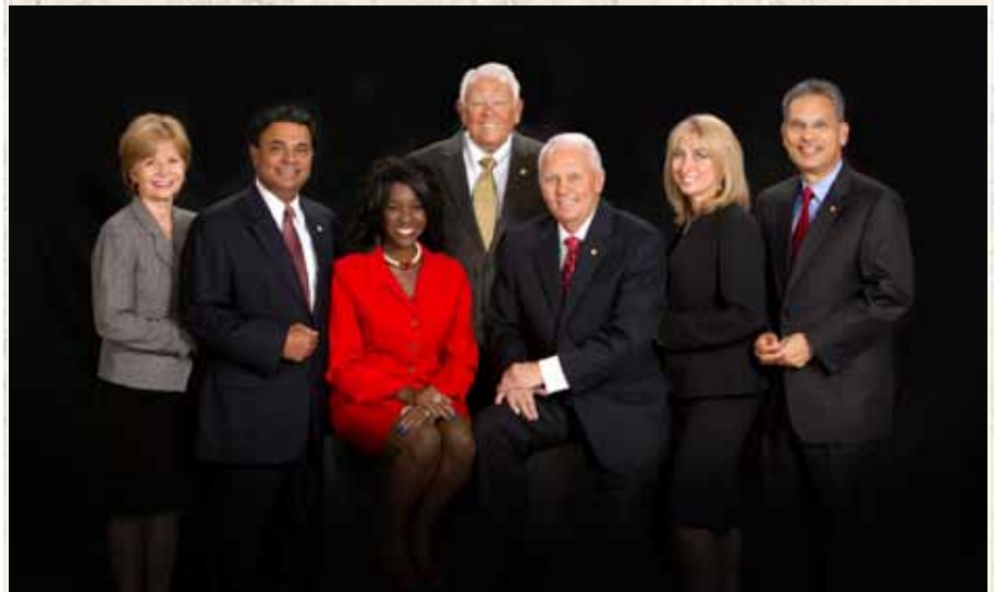
Sugar Land's 2011-2012 City Council from left to right:

For additional information about any of these subjects or past City Council agendas, go to www.sugarlandtx.gov and click on Meetings .